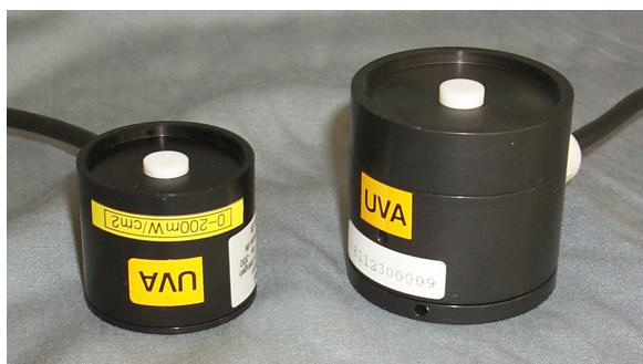
Fig. 1: Radiometer UV sensor (Standard version on the left, IP65 on the right)

The radiometer UV sensors serve as measuring heads for the measurement of UV irradiances with the radiometers RM12 and RM21 as well as with the dose controller UV-MAT.